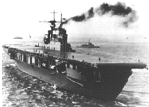
Above: Oct. 20, 1941 - USS Hornet (CV 8) was placed in commission in Norfolk, Va., Capt. Marc A. Mitscher in command. The ship was launched 14 Dec. 1940 at the Newport News Shipbuilding and Drydock Company.